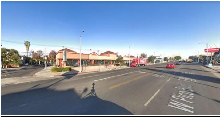
Pico and Point View