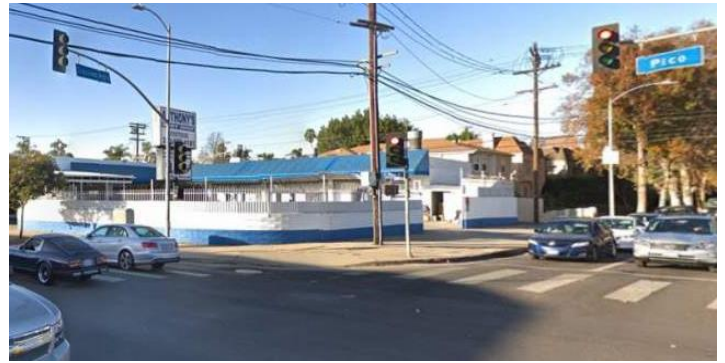
Pico and Crescent Heights